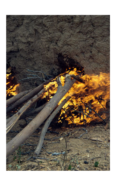
Figure 2: Firing bricks using wood as a fuel.

scientific knowledge is implicit. Also, facilities around the world and the resources available to those monitoring brick firing will be different. As far as possible, the method presented here minimises costs and the need for specialist services.